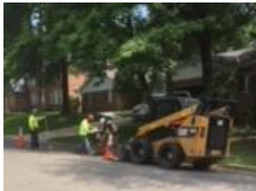
Preparatory Water Main Replacement Work, Partridge Place, June 7, 2018